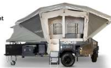
Aerial view with annex & roof rack installed